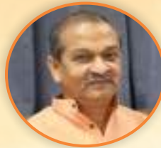
Shri Omprakash Sakhlecha Hon'ble Minister S&T and MSME, Govt. of M.P.