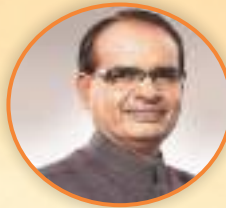
Shri Shivraj Singh Chauhan Hon'ble Chief Minister Madhya Pradesh