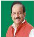
DR. HARSH VARDHAN